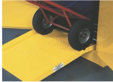
Drum Ramp 25932 fits all Justrite Drum Cabinets.