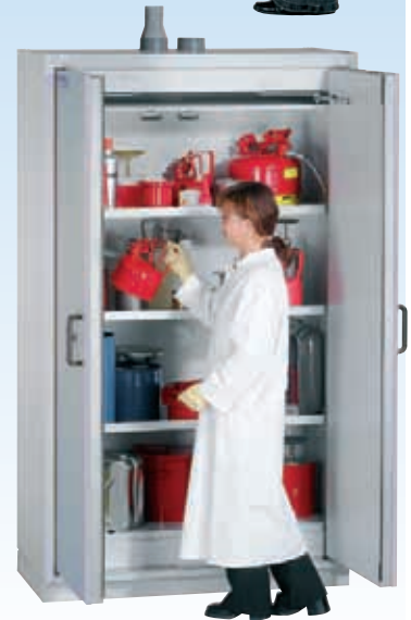
Model No 22510 Depth with the doors open: 1130 mm.

Each cabinet includes 3 shelves, 1 bottom tray and 1 tray insert, and packaging