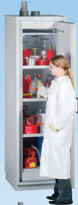
Model No 22500 Depth with the doors open: 1090 mm.

Total height including base (84.5 mm) and extractor connection (40 mm) is 1995 mm.