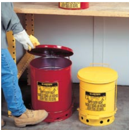
Different color cans help segregate waste rags.

Justrite oily waste cans are built in a range of sizes and all are FM approved.