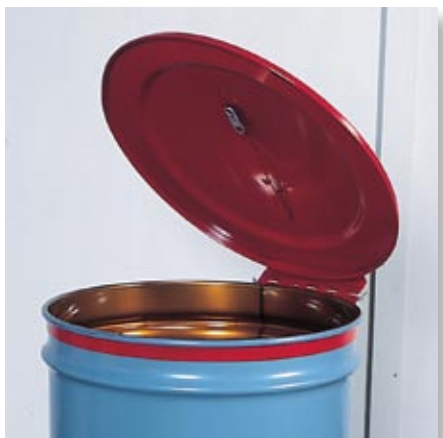
Self-closing drum cover with fusible link.

Air ports circulate air and disperse heat.