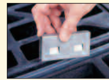
Easy to install Joining Clip

With the Sump-to-Sump™ Drain Kit, join accumulation centres together to expand sump capacity and meet local environmental requirements.